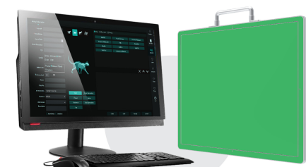
ATX DR ULTRA-140V

Tags: 14x17 , 17x17 , ATX , Digital radiography , DR Panel